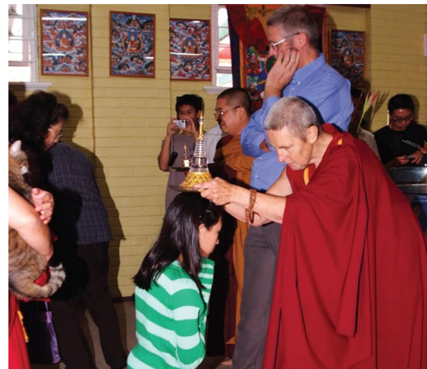
Venerable Thubten Chodron at the final relic blessing ceremony at Hayagriva, Perth.