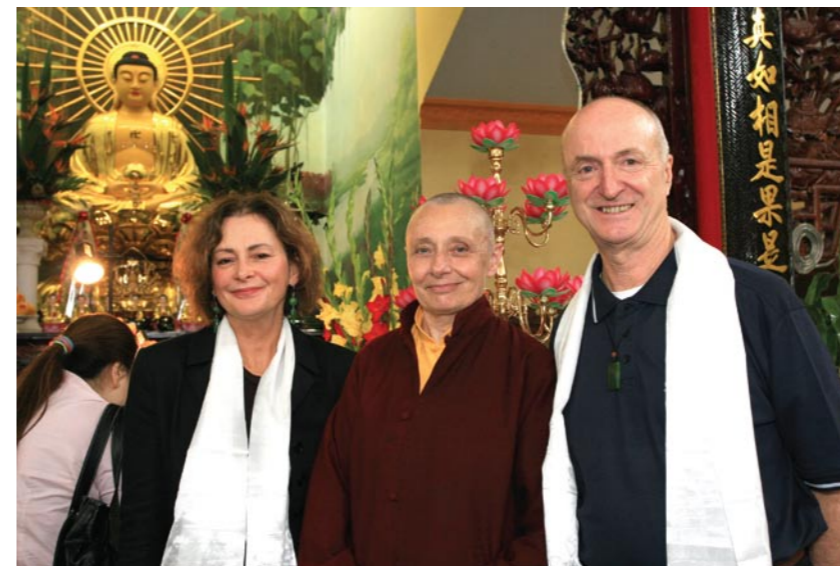
Jetsunma Tenzin Palmo was an honoured guest at the Adelaide Holy Relics Tour.