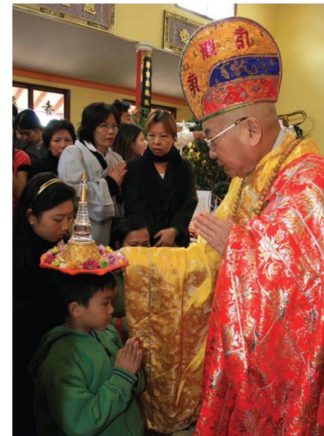
The Most Venerable Thich Nhu Hue gives Relic Blessing at Phap Hoa, Adelaide.